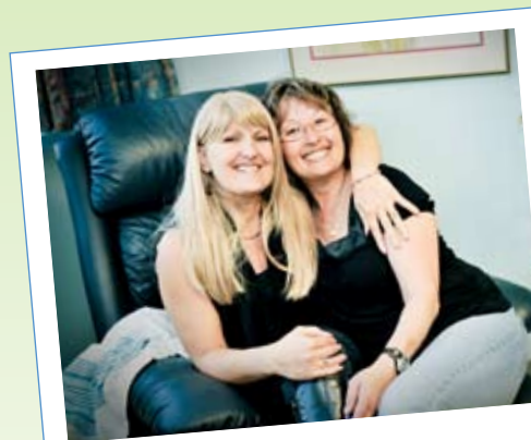
Supporting Excellence in Patient Care

We would like to thank all of our Caring Spirits, we are proud of you.