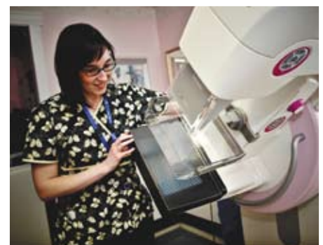
Supporting Excellence in Patient Care

At the end of the day, the purpose of all of our efforts and your donations are to purchase equipment for our local hospital and all funds stay here in Campbell River. All funds donated to the Hospital Foundation are used to purchase equipment for the various departments in our hospital based on priority or highest need.