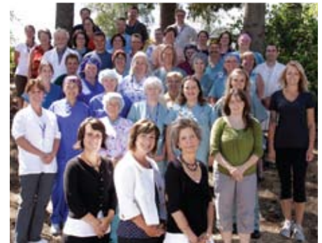
VIHA, Hospital Staff and Management

We have seen this relationship continue to grow including the support of VIHA with our addition of Pulse Coffee at the hospital. As mentioned, the main supporters of the kiosk are hospital staff and this show of support is appreciated and great to see. Hospital staff have also become heavily involved in our events by sitting on committees or participating in the events including entering two teams in the Canada Day Bed Race on July 1st, 2011.