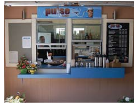
Pulse Coffee Kiosk

A new venture that the Hospital Foundation has undertaken as another fundraising avenue is the start-up of Pulse Coffee; our coffee kiosk situated at the entrance to the Campbell River hospital. The kiosk opened in May of 2010 and is into its second year of operation. The hospital staff are its most significant supporter, in addition to patients and their visitors. Pulse started by offering espresso and drip coffee and an assortment of baked goods, and is now serving lunch items. Local suppliers, including Steiner's Bakery, Willie's Café and Popsey's Log Cabin Restaurant, provide baked goods and lunch items. The coffee served is Aroma Coffee from Quadra Island and the tea products are from Stonehouse Teas. The Foundation is proud to support local businesses while raising additional funds to use to purchase equipment for our local hospital.