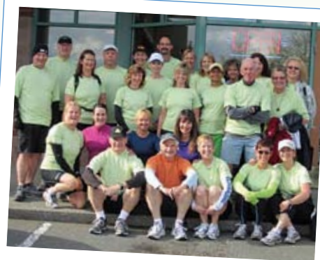
2011 Sportfit Pub Run, sponsored by Quinsam Coal.

Your support and dedication year after year benefits our Hospital, for all of us.