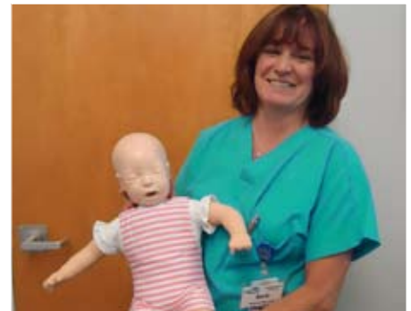
Baby Anne Dolls used for CPR training